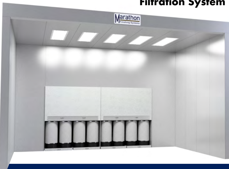
Open Face with Cartridge Filtration System