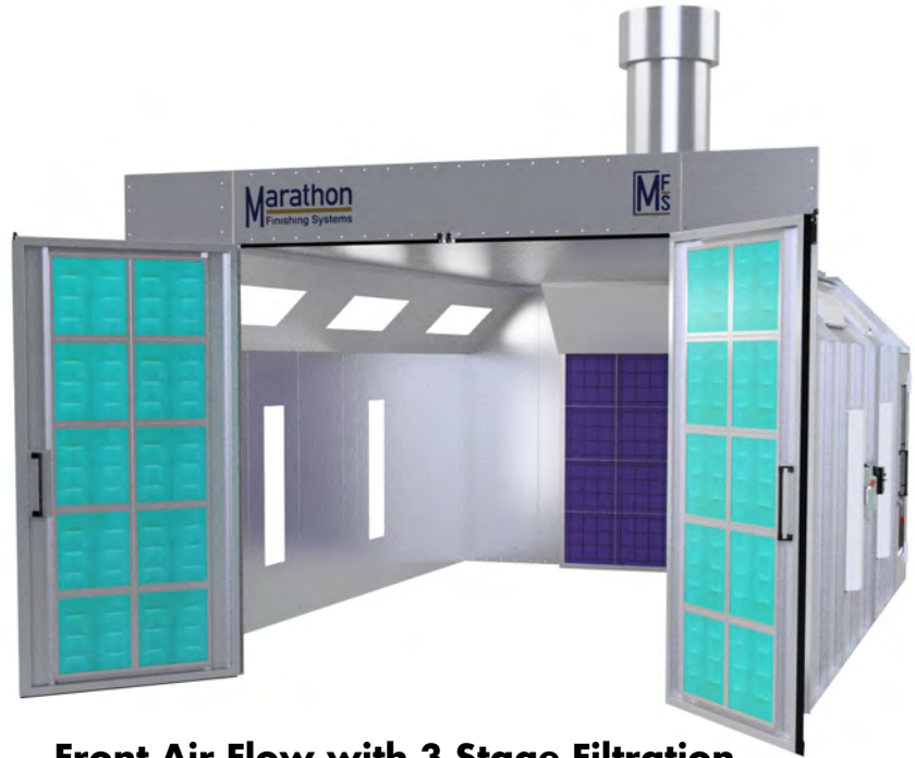
Front Air Flow with 3 Stage Filtration